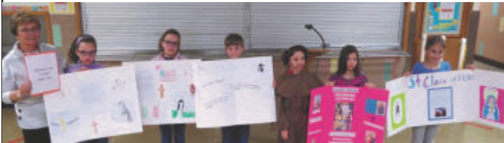
FFF Fourth Graders gave presentations about their favorite saint during the Saints Fair.