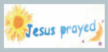
FFF Second Graders showing the Prayer Pillowcases they decorated!