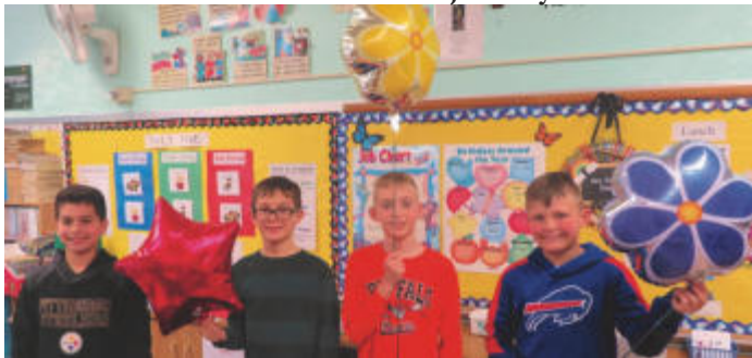
Congratulations to the FFF Weekly Program Students who had perfect attendance for the 2018-2019 year!

We were proud to recognize 26 students from the Weekly FFF Program for having perfect attendance throughout this school year! Pictured below are some of those students. Great job to you all!!