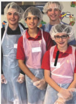
Grade 8 Students kicked off the Middle School Service Projects by going to Response for Love Center.

St. Gregory the Great School is searching for alumni to begin coordinating an event for Summer 2020 as the school will be celebrating 60 years! THE NEXT MEETING IS WEDNESDAY, OCTOBER 23, AT 6:30 PM IN THE CAFÉ! BRING YOUR GRADE 8 PHOTO TO SHARE YOUR MEMORIES AND HELP US ORGANIZE TO CELEBRATE THIS MOMENTOUS OCCASION.