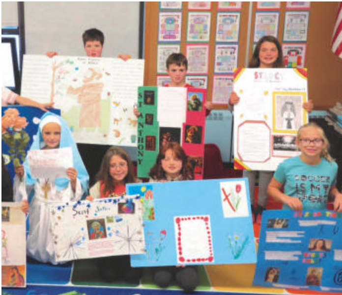
FFF Fourth Grade Saints Fair: Students were excited to make their presentations and share their Saints posters. Some even came dressed as their Saint!

Save the date: Join us for the Christmas Pageant on Saturday, December 14 at 9:15 am in the School Gym!