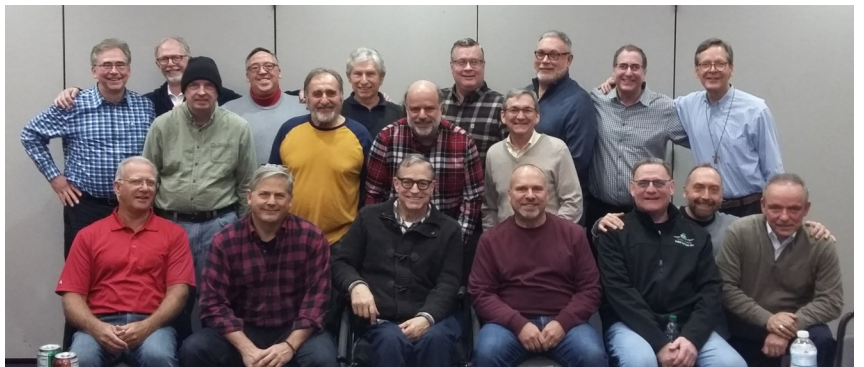
A pre-Covid gathering of members from Men of God.