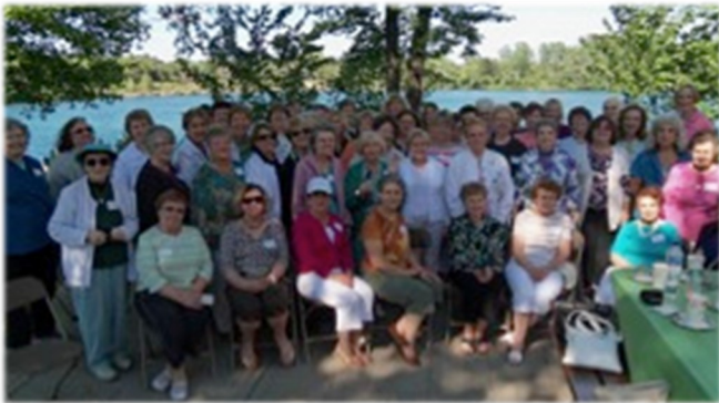
LOL 2013 Picnic

At present we have about 165 members officially, and pre-Covid would have around 70 at each meeting. We begin each meeting with a prayer to the Holy Spirit. Then we offer our petitions, and pray the Rosary and the Divine Mercy Chaplet. We have readings then, from The Catholic Catechism, the Bible, and St. Faustina's diary. Sometimes we have a speaker. We end with what we call a fellowship table, where we enjoy earthly food to complement our spiritual nourishment. All women are welcome, no matter where they are in their spiritual journey. There are no dues. We meet at Church on the second Thursday of each month at 7:00 pm.