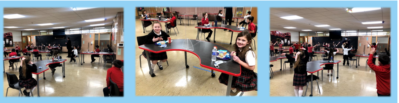
The St. Gregory the Great students celebrated the morning after with a breakfast with the priests and administration.